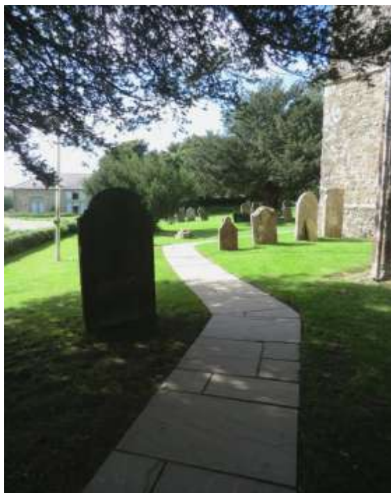
More views of the new Church path recently laid at St Nicholas Church Boughton Malherbe