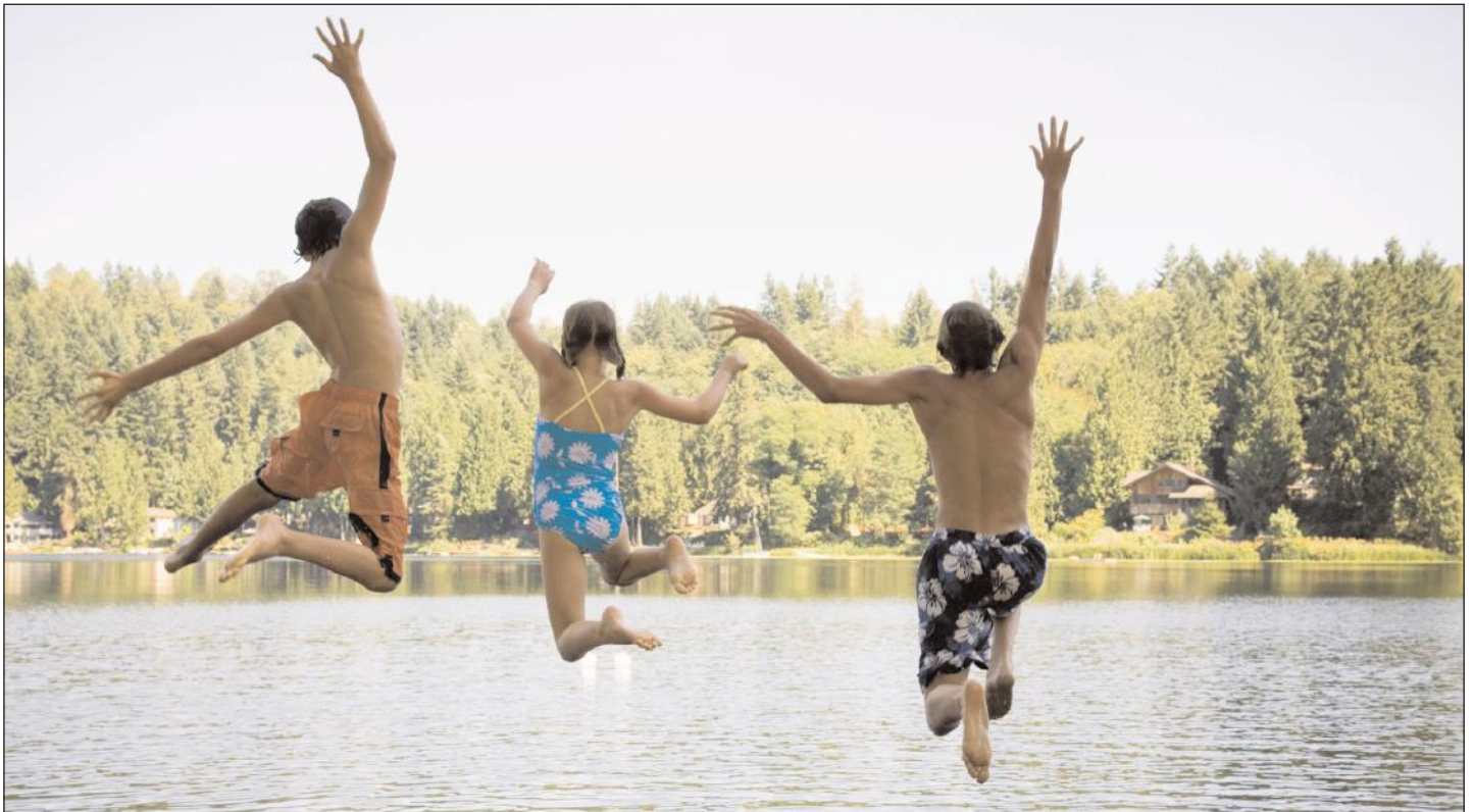
Children need to be taught about the dangers of misbehaving on open water