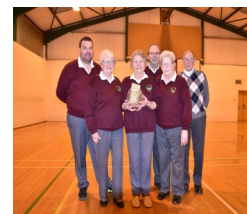
High Fives Winners

http://www.verdemat.co.uk/cms.php?id cms=8