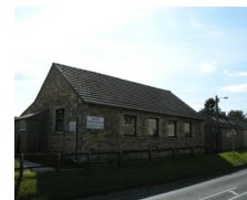
Swinton Reading Room And Community Hall