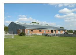
BSA Sports Centre

Book the Facilities inside, or outdoor Pitches. Tel: after 7pm. 01653 690807