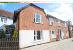
Hamble £875 per month