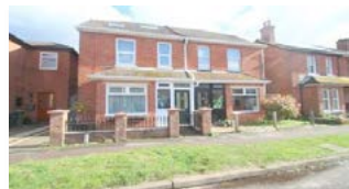
Netley Abbey £385,000