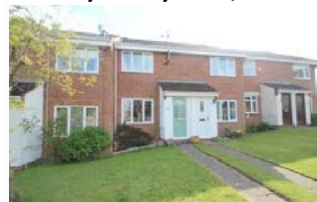
Hamble £795 per month