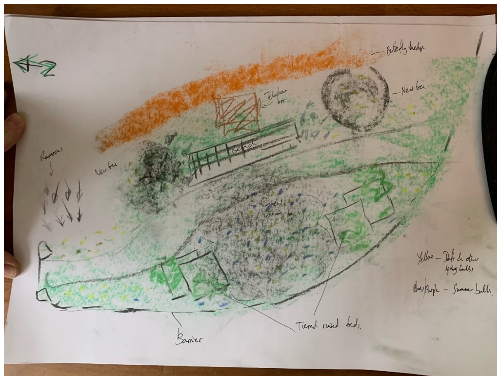
Proposal for Green by Phone Kiosk