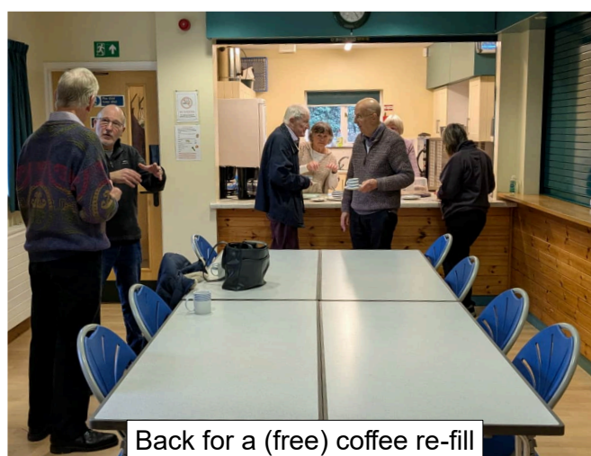
Back for a (free) coffee re-fill

There is a willing cadre of volunteers supporting this venture, who carry out their allocated functions in accordance with a calendar of dates and responsibilities set at the start of every year.