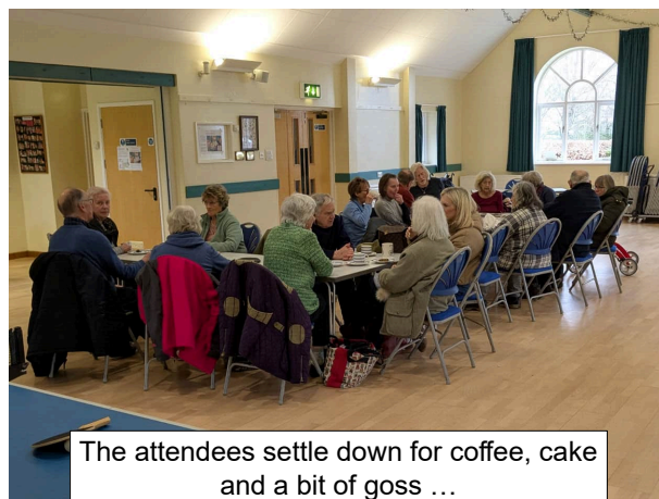
The attendees settle down for coffee, cake and a bit of goss ...