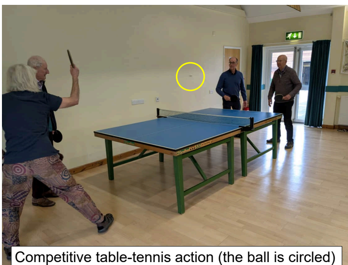
Competitive table-tennis action (the ball is circled)

It would be lovely to see you there. Why not give it a try?