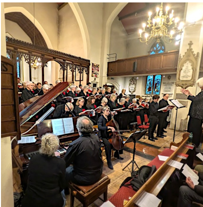
An appreciative audience enjoyed a pared-down yet still moving performance of Bach's powerful St John Passion , by Laughton Village Choir on Saturday at Holy Cross Church in Uckfield.

Laughton Ladies Stoolball Club are looking for both an umpire and a scorer. The umpire would be to cover Tuesday matches, which are normally away fixtures, against sides between Chiddingly and Hassocks (most closer than that). The scorer could be needed at home and away. Cricket knowledge helpful for both roles; please call or message 07855 534664.