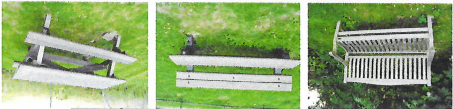
The bench seating and picnic bench were complete and secure