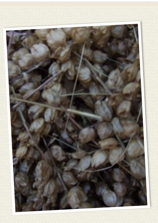
Yellow rattle seed heads. We collected 1.5 kilos of seed last year. We would like, with your help to double that amount.