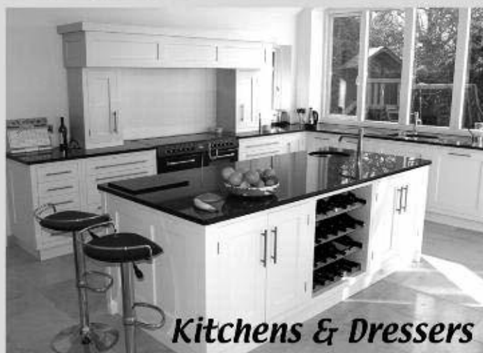
Kitchens & Dressers