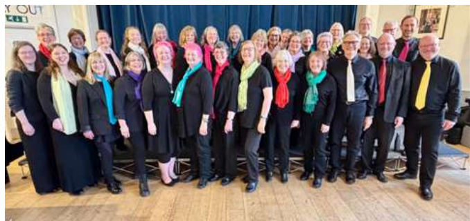
You see us here just after performing

Sutton Singers performed “ Outstandingly ” at Chipping Norton Music Festival according to the adjudicator. And Sutton Singers were buzzing afterwards.