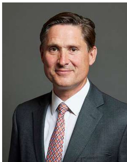
CHARLIE MAYNARD MP charlie.maynard.mp@parliament.uk