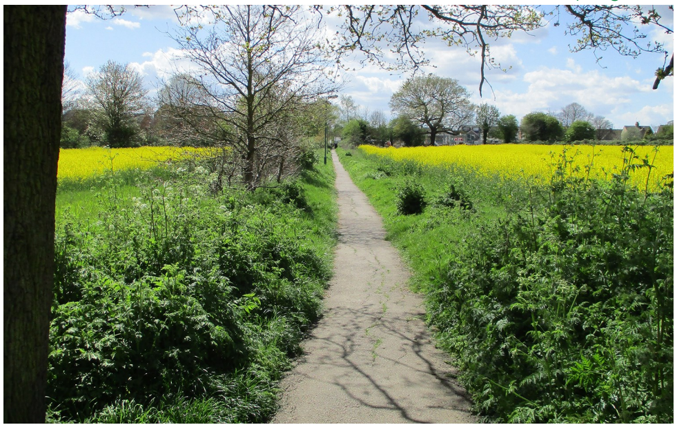
The path from the station to the recreation ground on a beautiful summer's day

What's been going on in Dunton Green? What's new?